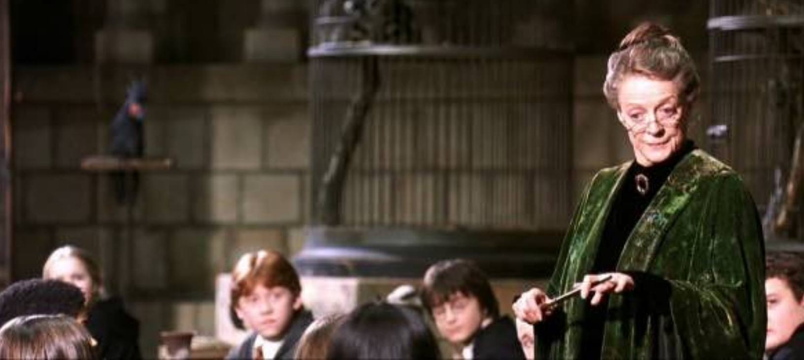
Harry Potter and the Chamber of Secrets